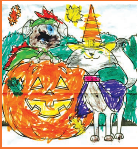
1st Place: Weston Klee PORT CLINTON, PA