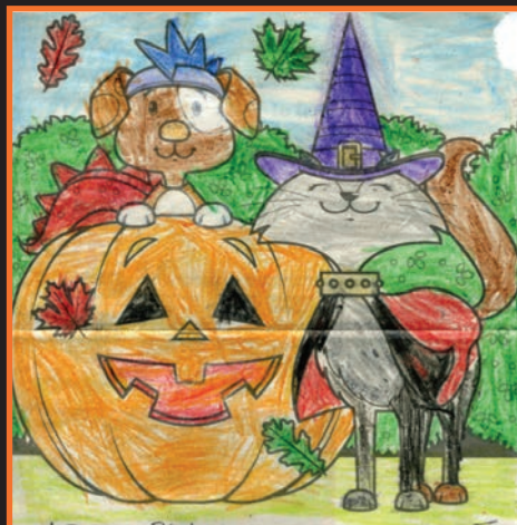
2nd Place: Lacey Bickel HAMBURG, PA