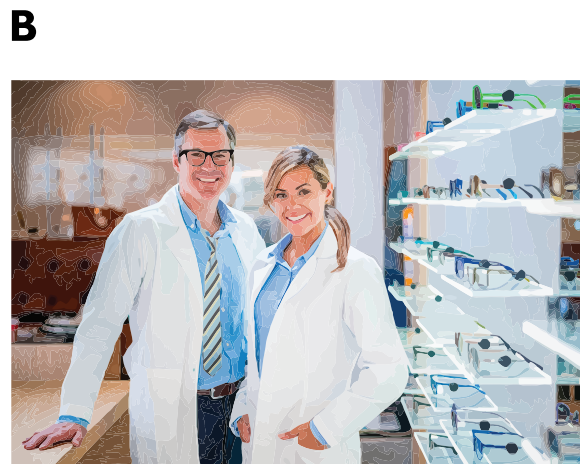
Answers: 1. Glasses on man 2. Tie on man 3. Missing glasses on shelf 4. Ponytail on woman