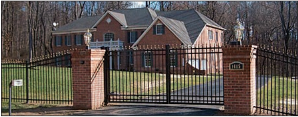
Automated Gate Entrances