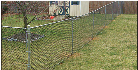
Chain Link Fence

All Vinyl and Aluminum Fence Fabricated On-Site Eliminate The Middle Man