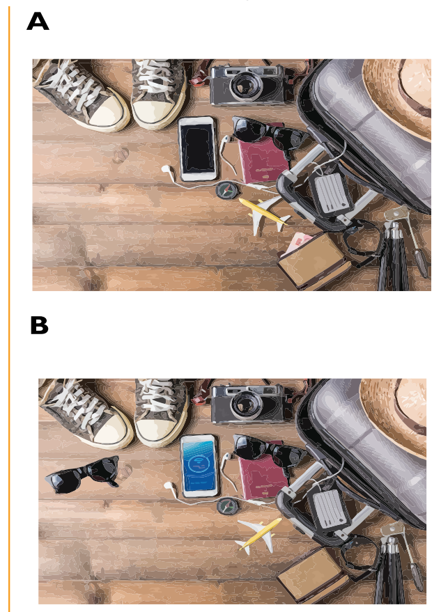
Answers: 1. Two pairs of sunglasses 2. Plane is turned 3. Phone has screen 4. Wallet is missing money

WHAT'S THE DIFFERENCE? There are four things different between Pictures A and B. Can you find them all?