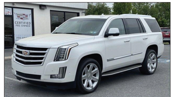
2017 Cadillac Escalade U588T, Reg Ext., Lux Model, 30K Miles