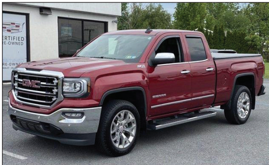
2018 GMC Sierra 1500 SLT G21343A, 4x4, 8K Miles

3 LOCATIONS: FLEETWOOD • MORGANTOWN • PREOWNED SUPERSTORE RT. 222