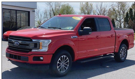
2018 Ford F150 XLT U5867, 4x4, Turbo, Only 23K Miles