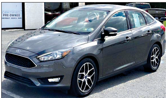
2017 Ford Focus SEL U5870, Low Miles