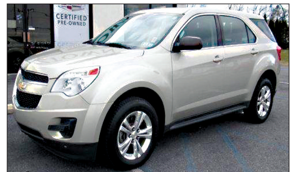
2015 Chevy Equinox U5457B, Low Miles, AWD