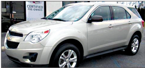
2015 Chevy Equinox U5457B, Low Miles, AWD