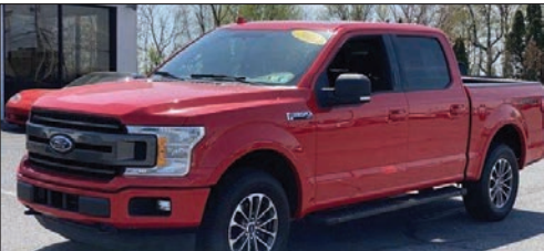
2018 Ford F150 XLT U5867, 4x4, Turbo, Only 23K Miles