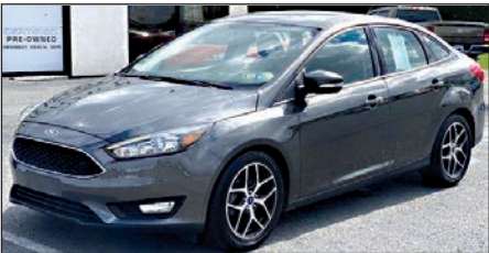
2017 Ford Focus SEL U5870, Low Miles