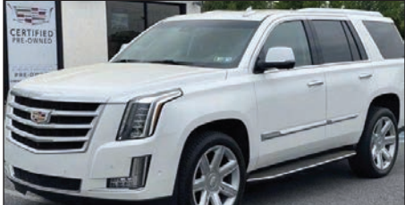
2017 Cadillac Escalade U588T, Reg Ext., Lux Model, 30K Miles