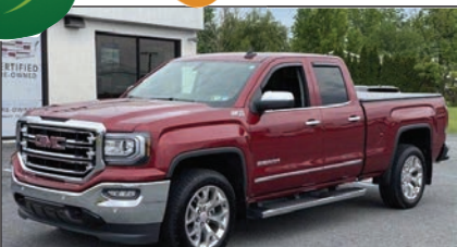
2018 GMC Sierra 1500 SLT G21343A, 4x4, 8K Miles