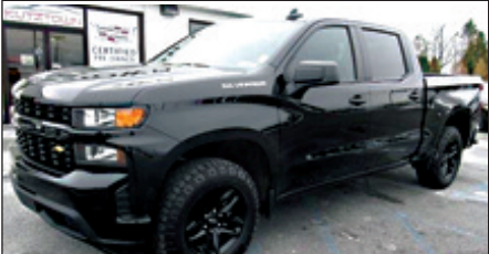
2019 Chevy Silverado Custom Crew U5821, 28L Miles