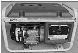
2011 Wacker 2500-Watt Generator w/Honda New Price $1,199 Used $699