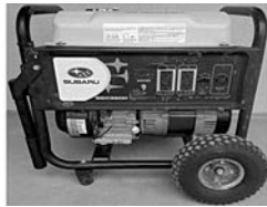
2014 Subaru 3500-Watt Generator w/Subaru New Price $899 Used $399