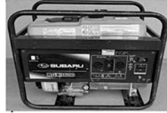
2014 Subaru 3600-Watt Premium Generator w/Subaru New Price $1399 Used $699