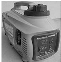
2016 Generac 2000-Watt Inverter New Price $899 Used $499