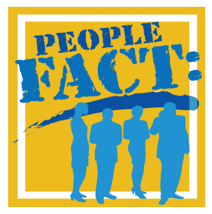
THIS HOBBY CAN KEEP PEOPLE ACTIVI AND IS RELAXING ENOUGH THAT IT MAY HELP REDUCE STRESS.

Send your recipes to: The Windsor Press, Inc. 6 N. Third St., PO Box 465, Hamburg, PA 19526-0456 Fax: 610.562.2770 or E-mail: display @windsorpress.com