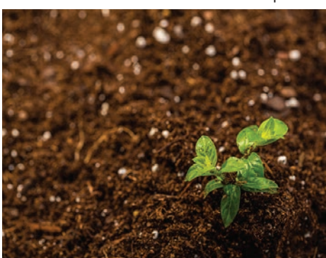
Page 6 -L&G

Disinfect your tools. It's common to clean tools in late fall or whenever they're typically placed in storage for the winter. But cleaning and disinfecting are not necessarily the same thing. If tools were not disinfected at the end of the previous