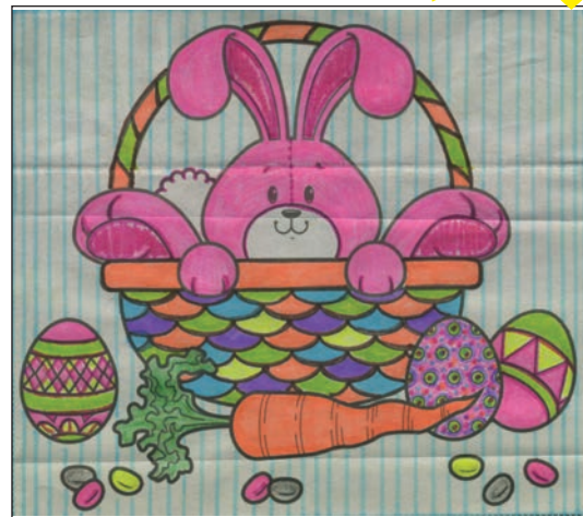
2 nd Place: Cassandra Sobczok