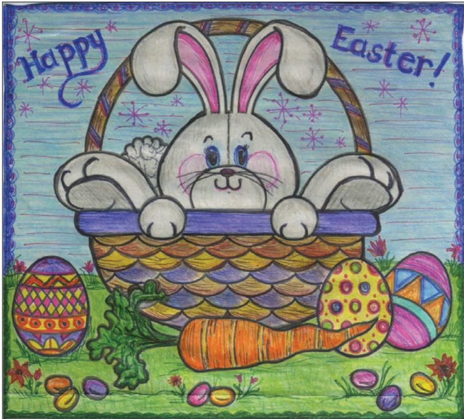
1 st Place: Dianne McConigle