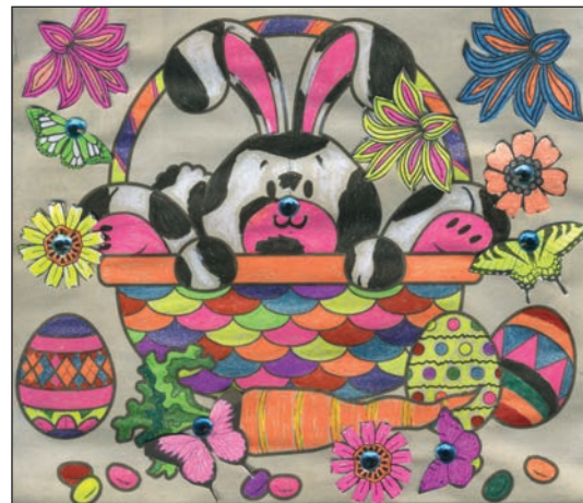
3 rd Place: Elda Correll